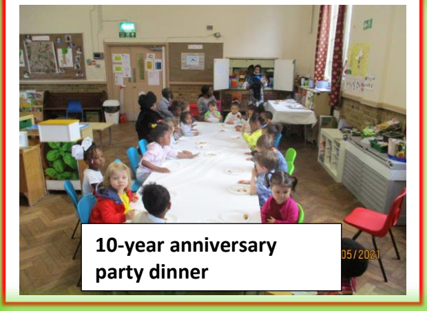
10-year anniversary party dinner