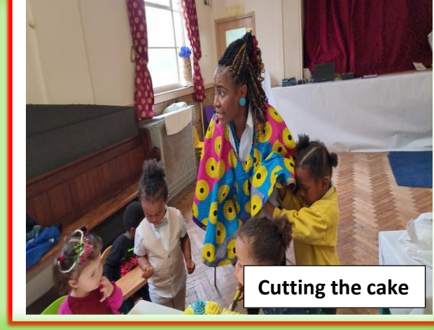
Cutting the cake