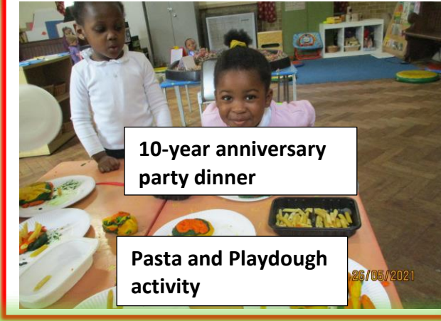
10-year anniversary party dinner