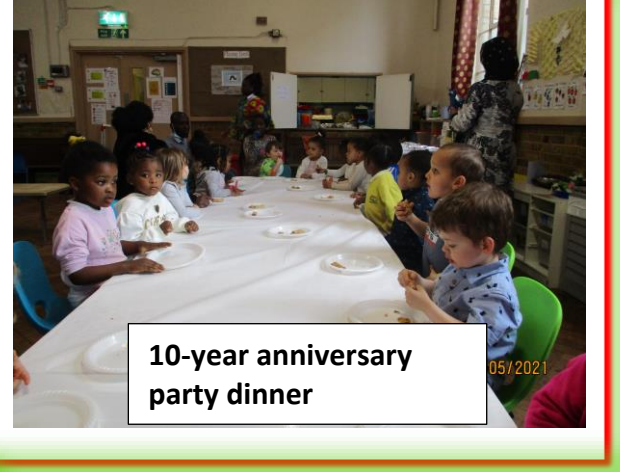
10-year anniversary party dinner